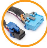
Vehicle Specific Harness (actual harness may vary)